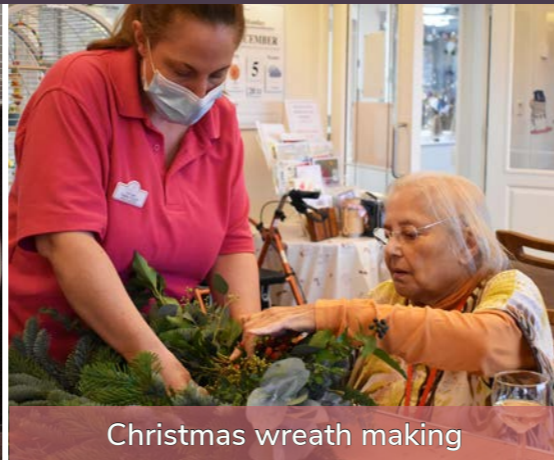
Christmas wreath making