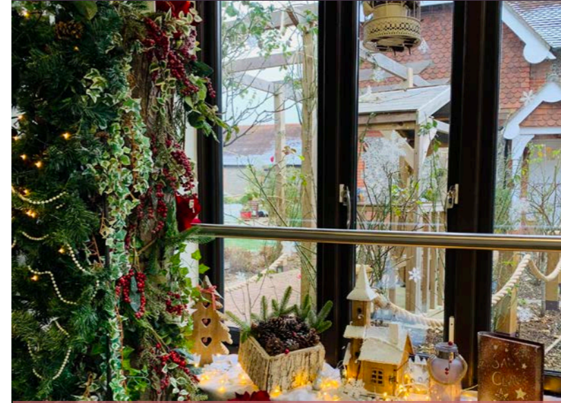
We love decorating our walkway throughout the seasons!