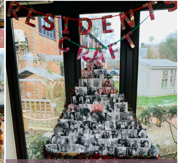
A photo tree of all of our lovely residents, whilst remembering those who have passed