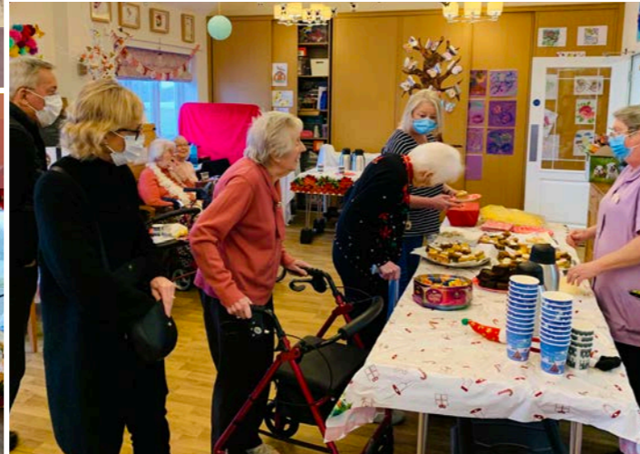
Delicious cakes, gingerbread, mulled wine and gifts for donations at our Christmas Bazaar!