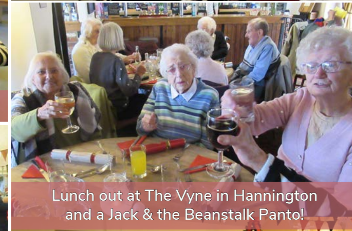
Lunch out at The Vyne in Hannington and a Jack & the Beanstalk Panto!