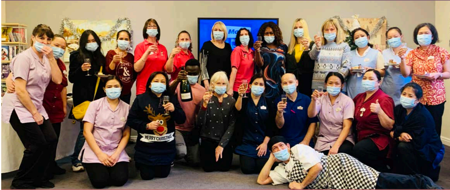
Staff Christmas Celebrations at Oak Lodge with a raffle, Secret Santa gifts, a tasty buffet & bubbly!