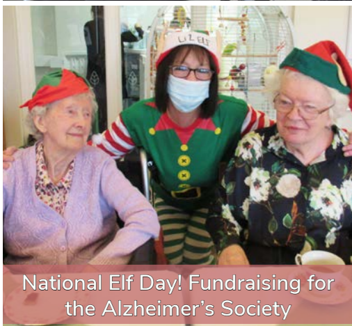
National Elf Day! Fundraising for the Alzheimer's Society