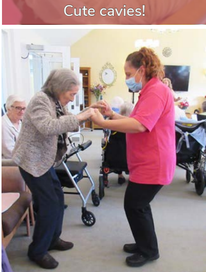
Dancing and Arts & Crafts