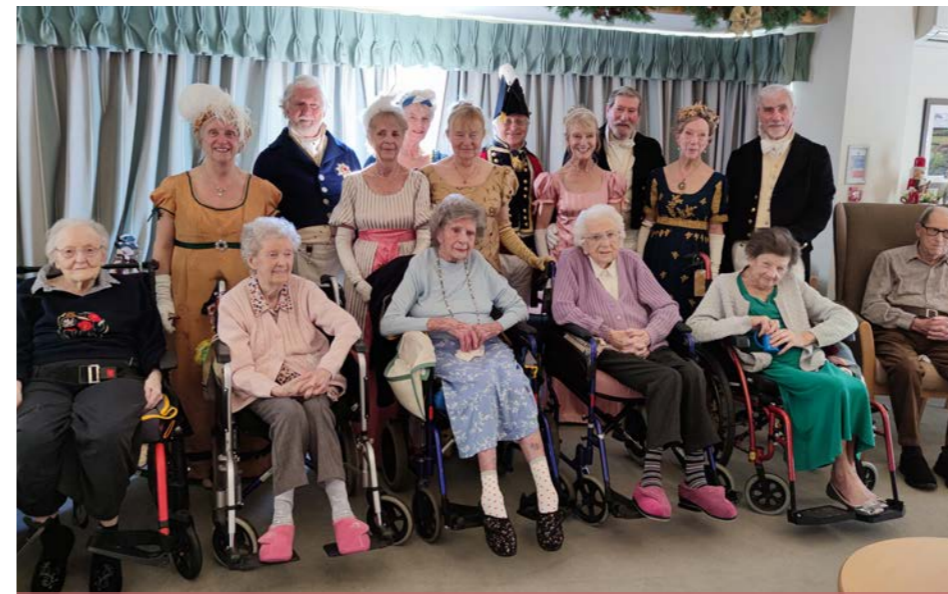
Residents always enjoy regency costume, dancing and music