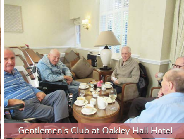
Gentlemen's Club at Oakley Hall Hotel