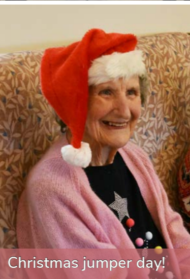
Christmas jumper day!