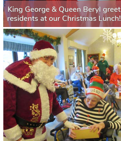
A visit from Father Christmas