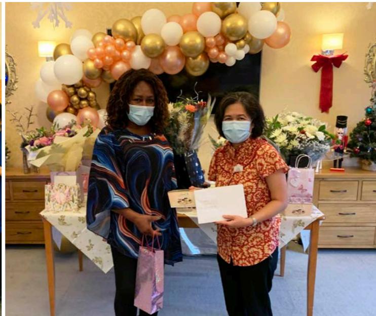
Our staff 'Years of Service' Awards recognise the valuable contribution our staff make to the running of Oak Lodge. A big thank you to everyone!