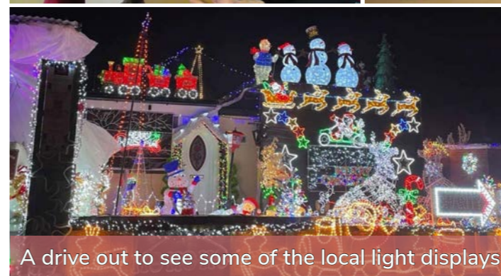
A drive out to see some of the local light displays