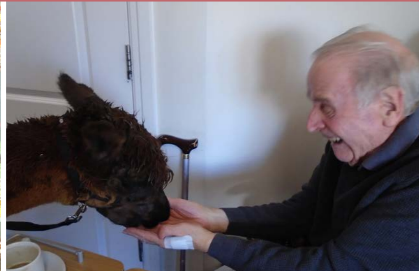
A visit from a few friendly alpacas!