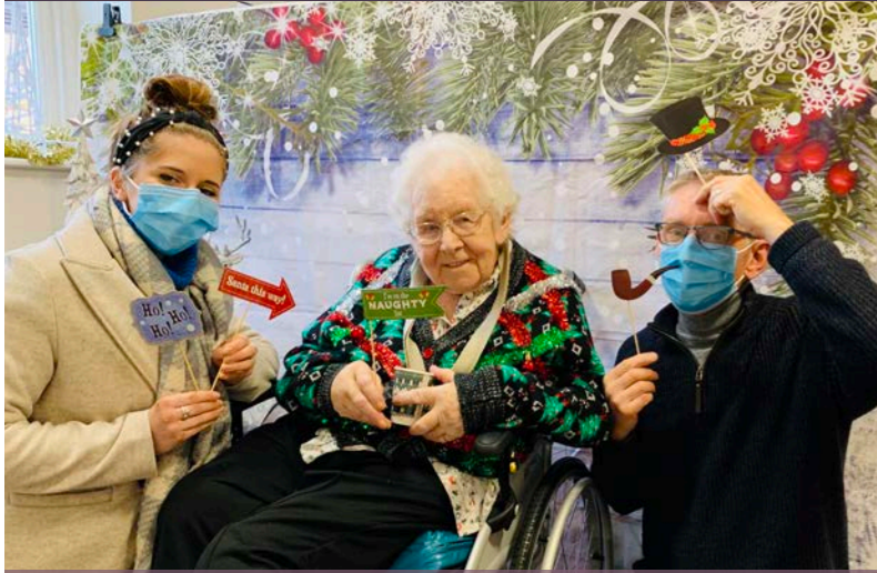
A prop-filled photoshoot with friends and loved ones