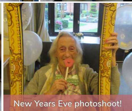
New Years Eve photoshoot!